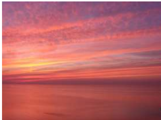
Beautiful Hatteras sunset.

Because we did get some more sailing by the end of the last week it prompted us to book later next year in hopes of getting some real wind. The plan is to go for only 2 weeks and increase our trip to Bonaire to a month in 2014.