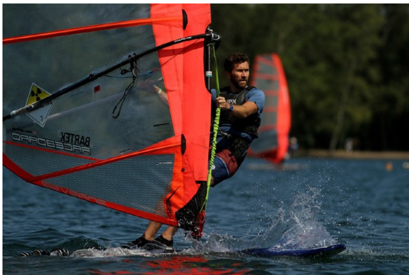
Our new President in action in Toronto!