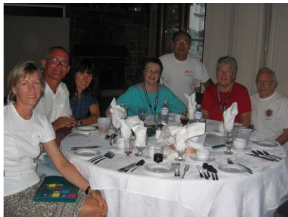
Some of our oldest and newest members.