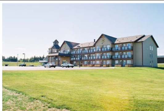
Super 8 and grassy rigging area in Caraquet.

It's official! We are going back to New Brunswick in 2009. More precisely to Caraquet. Roch Chiasson and his group have been busy trying to organize a wind and kite event as part of the Conférence mondiale acadien which will be held in 2009. Our event will be held on our regular weekend, August 1 to 3, 2009, and the kite event will be held two weeks later. Roch has reserved 10 rooms for us at the Super 8 in Caraquet. If you want to stay there, book your room asap as the area is going to be very busy at that time. There are 4 rooms with a balcony on the water side ($189 incl. breakfast) and 6 on the other side ($169 incl. breakfast). Visit http://www.super8caraquet.com:80/ to see the motel. If you look at the image gallery (link on the left side) you will notice a big grassy area. That is where we will rig and leave our equipment under the watch of a security guard. The motel is located on the beach and we can sail from there. I'm told that during our weekend, there will be fireworks and local musical groups to entertain us. We will try to give you a more detailed list of lodging a bit later. ❖